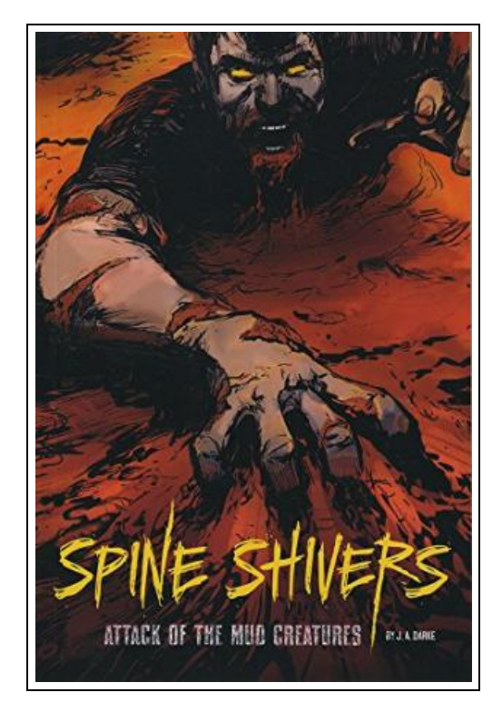
Filesize: 2.09 MB