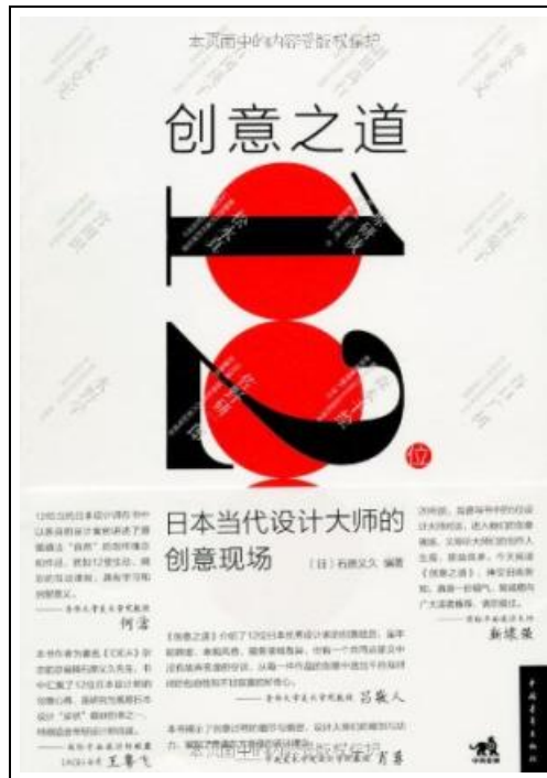
Filesize: 6.33 MB