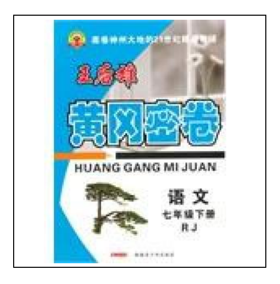
Filesize: 9.28 MB